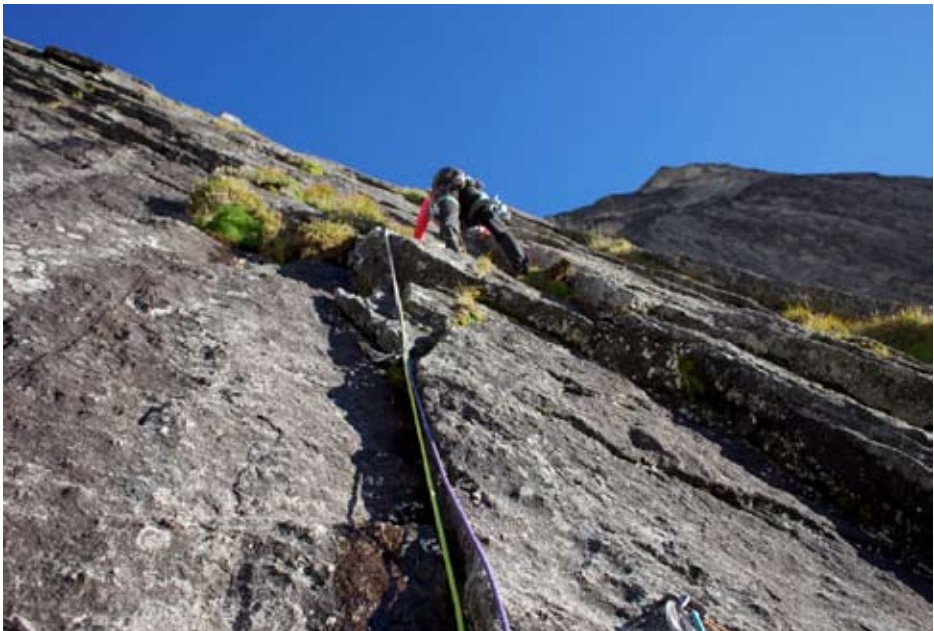
Pitch 4, easy, grassy, a little loose