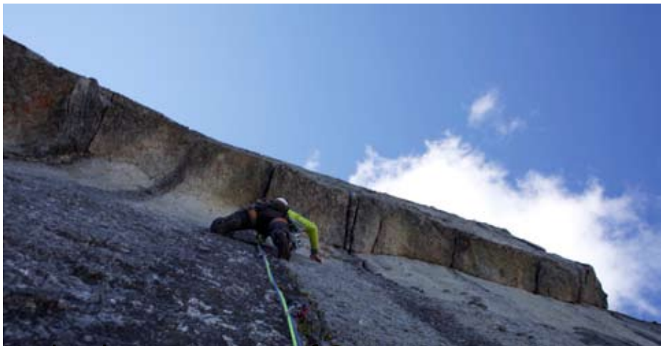
Under the crux 5.11 roof, P16