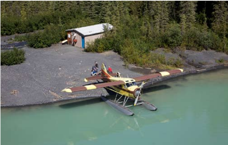
Back at Glacier Lake, you can leave extra food and supplies in the tan shed in the background. Its only four hours round trip from fairy meadows with a light pack