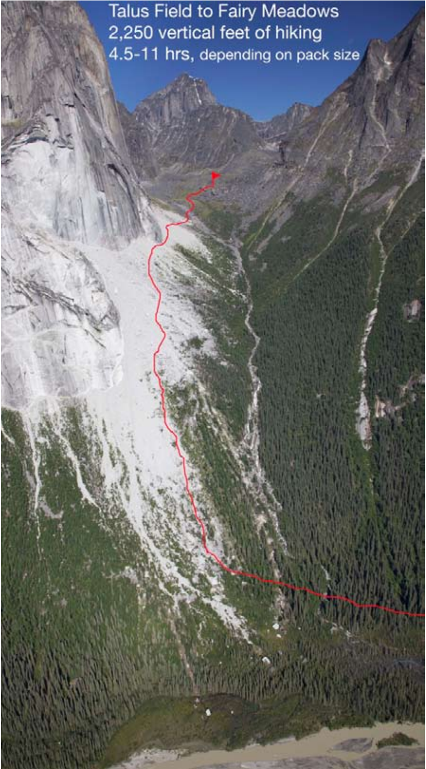
This is the loose talus field you get to go up and down if you take the float plane. Be careful!