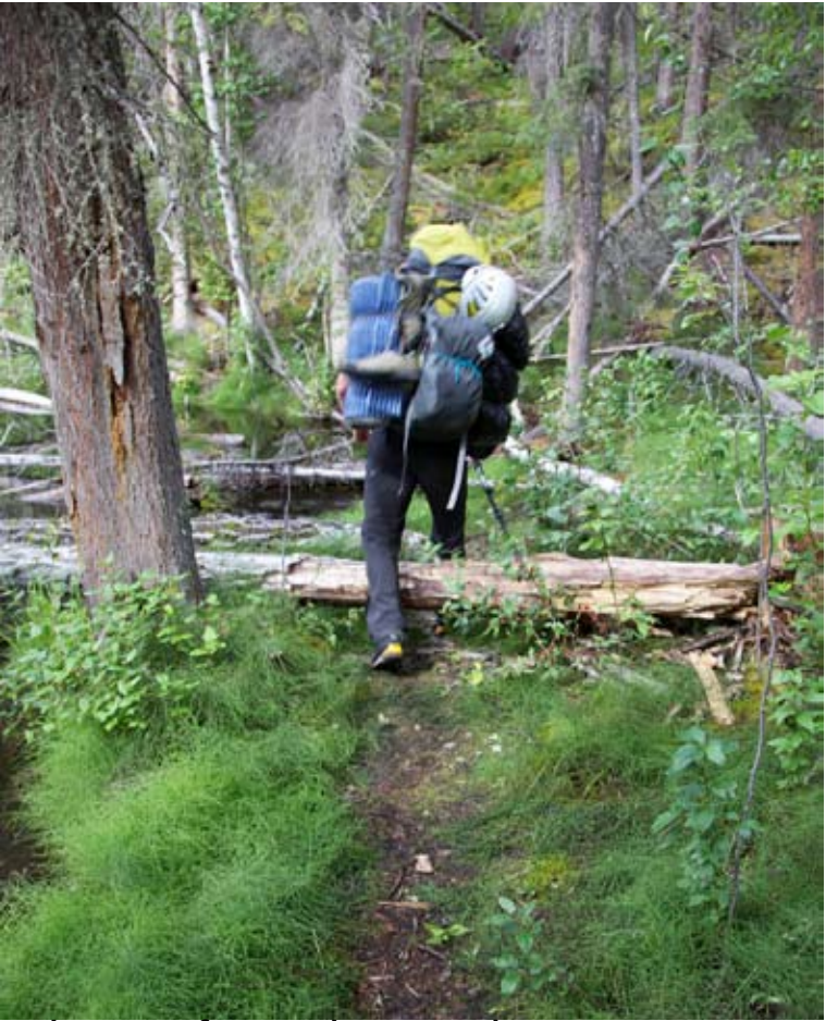
Hiking in from Glacier Lake