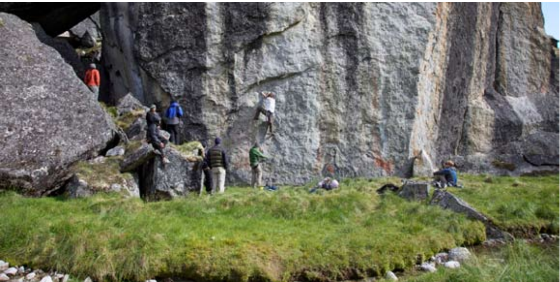
Cragging in Fairy Meadows, please dont bolt worthlessly