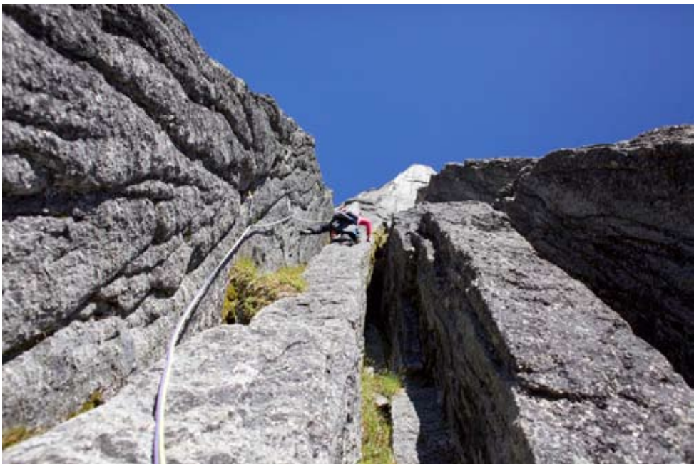
One of the “chimney” pitches.