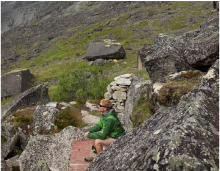
Pit Toilet, use it! Bring your own TP