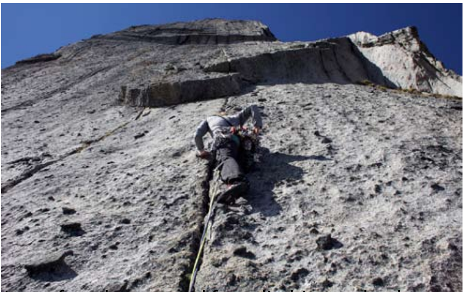
Lots of crack protected face climbing on knobs