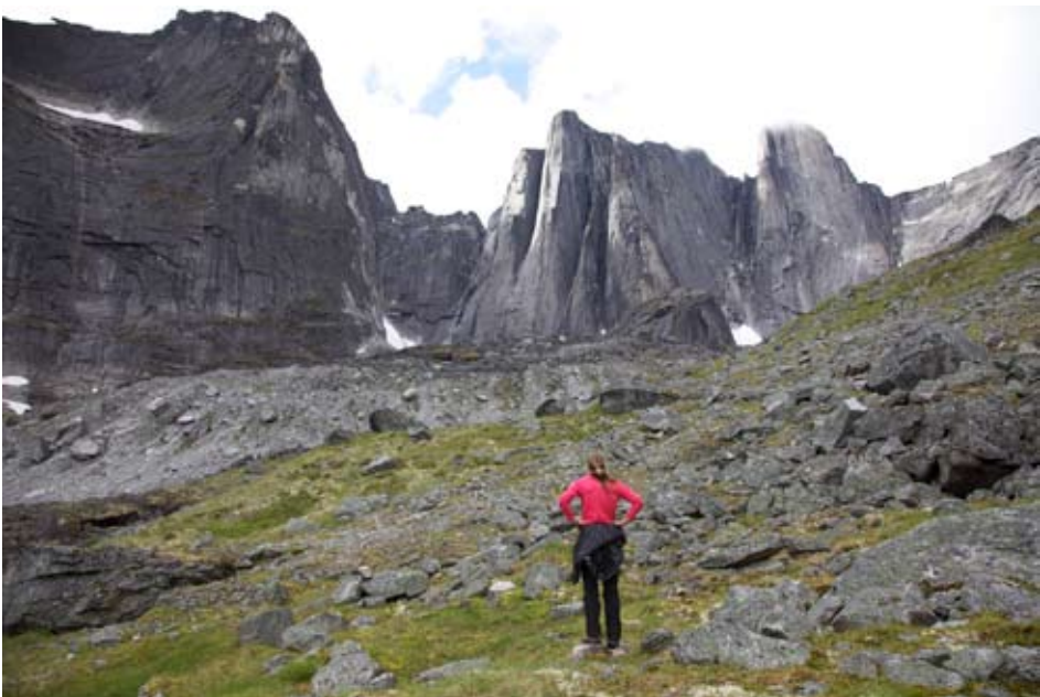
View of the Lotus Flower Tower from camp