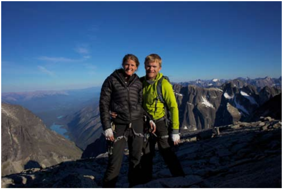
On the summit after 14 hours of climbing!