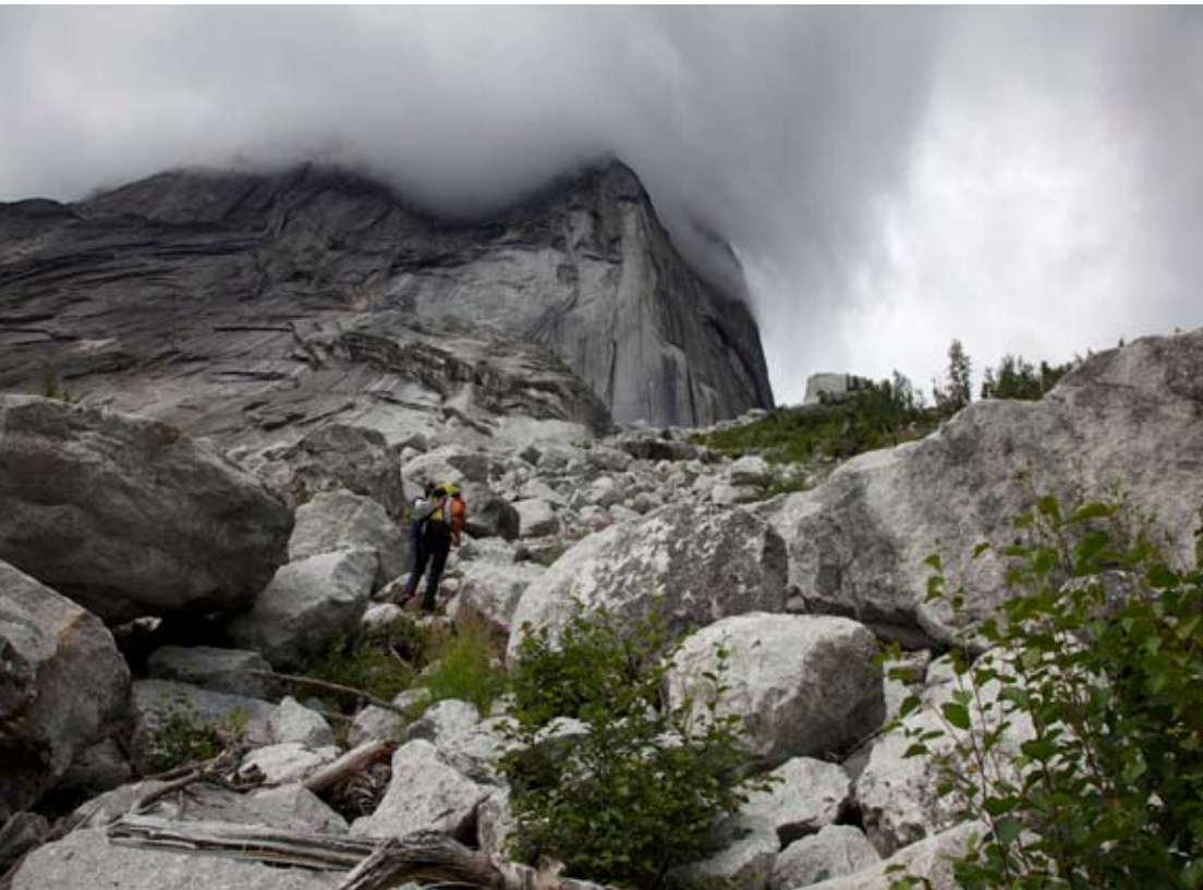
Start of the Talus Field, Mt Harrison Smith above