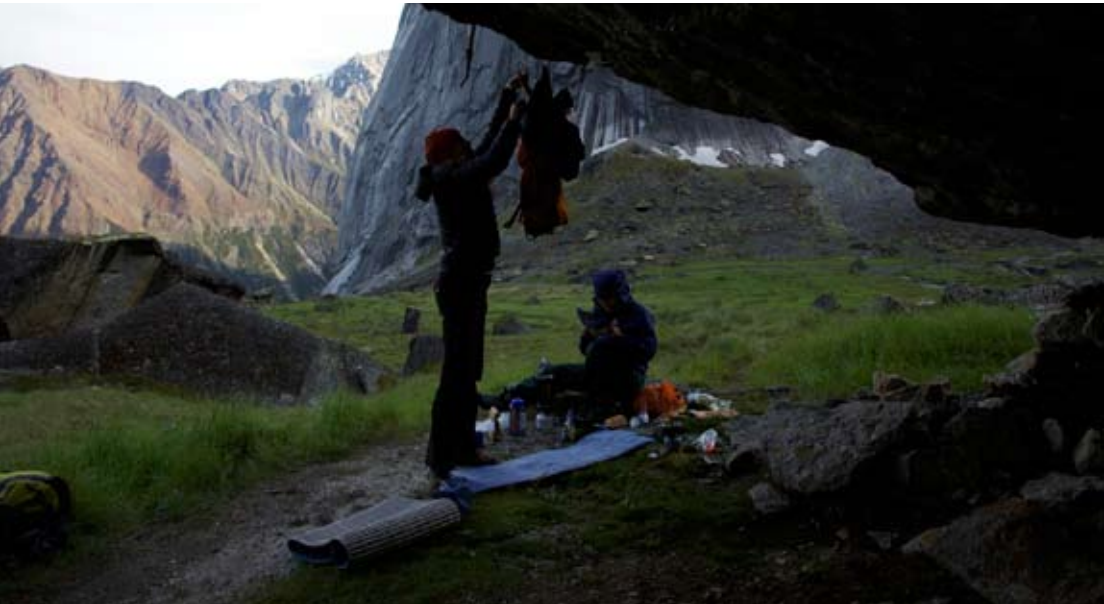
Camping under a boulder, hang your food and packs