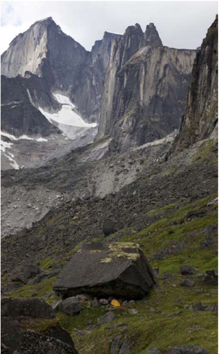
Fairy Meadows, Mt Proboscus in the background