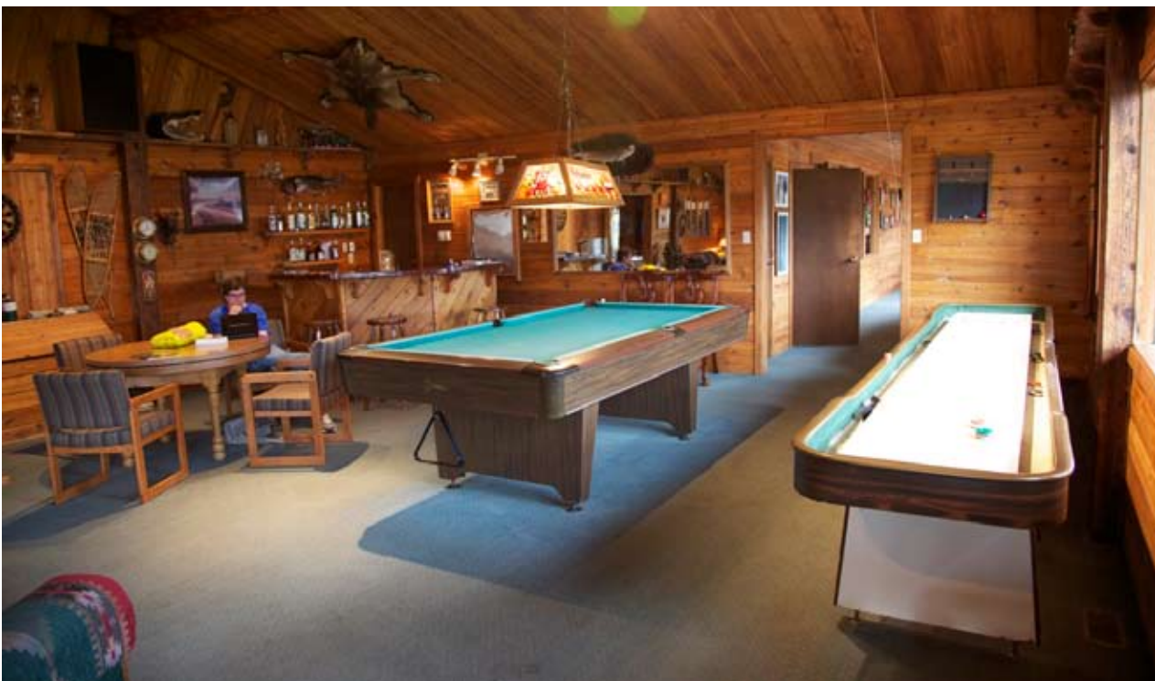
Back at the Inconnu Fishing Lodge. Where you can do laundry, eat, shower, check email and play billards. That is included in the price of the flight to the Cirque!