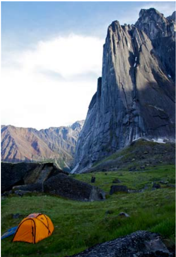
Many camping options in Fairy Meadows