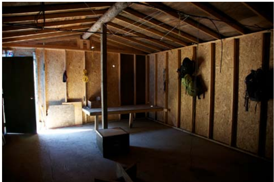
Inside the tan shed on Glacier Lake