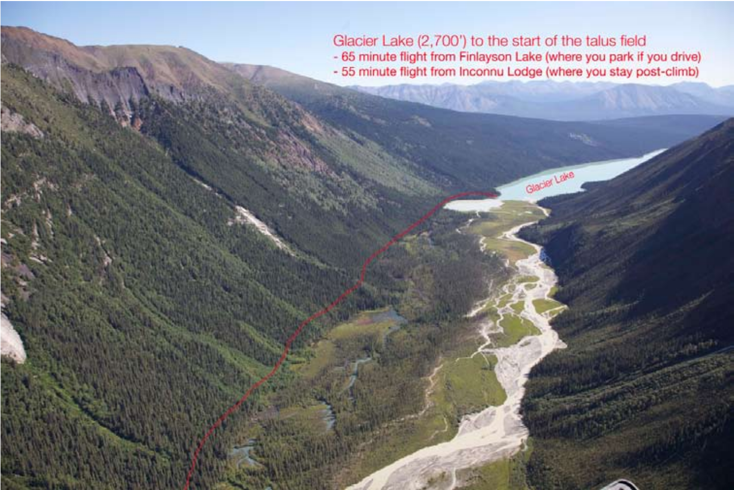
Where the float plane drops you off to hike to the Cirque. Looking back from the talus field. To hike from the lake to the edge of the photo is one hour.