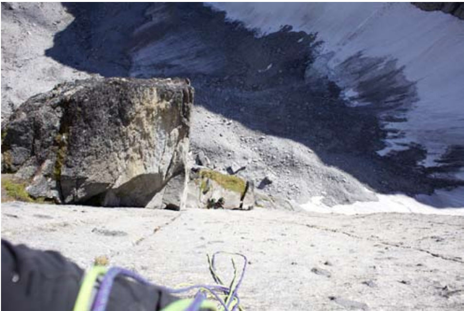
Looking down from P12, bivy ledge below