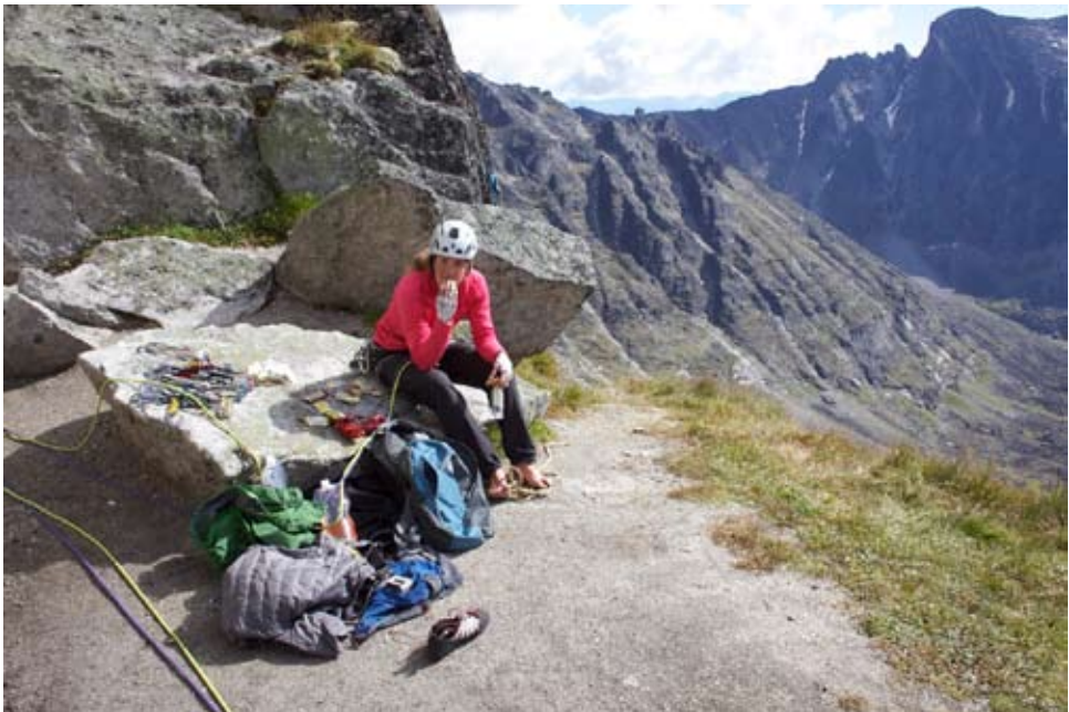
Bivy Ledge. Top of P10. Sleeps 4-6 people, no water