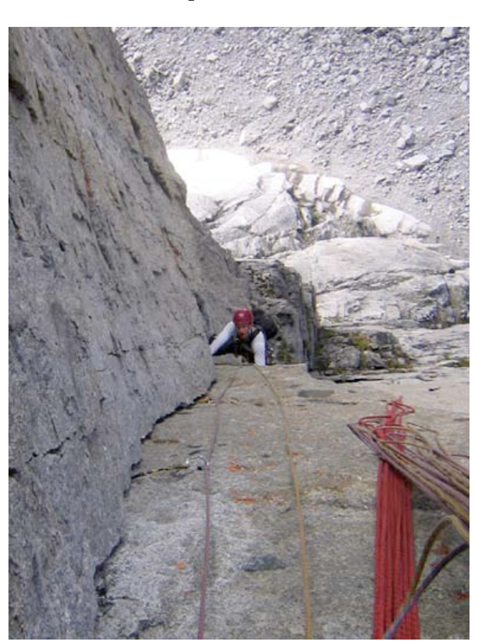
One of the better pitches of Club International

Club International (V, 5.11): We attempted this route during a cloudy but temporarily dry morning. As far as we were able to discern, it had not seen an ascent since last summer, and few ascents before that. The position on this route is amazing, and the climbing in places is spectacular; it will be a classic route once it cleans up a bit. The "drippy roof" indicated on the topo was more of a muddy waterfall, though, and was fully aided. It is a great route, at least from what we saw of the first two-thirds, before the rain eventually forced us down. As of August 2006, there was a short bit of rope coiled at the belay below the big "drippy roof" that can be used to fix the pitch for descent. It is not in great shape, but will be sufficient to pull you into the belay under the roof. Before relying on this rope, it would be prudent to check if it's there with binoculars (it is about 25 feet below the small darkened roof that is just down and left of the obvious huge, blocky roof that is two-thirds of the way up the face).